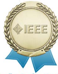
Outstanding Section Membership Recruitment and Retention Performance

For 2017 goals, we reviewed five years of history. Each Section has a unique goal based on different dynamics - whether the Section has had growth or decline, as well as the overall size and location of the Section. Note that reinstatement goals are assigned on the Region level only.